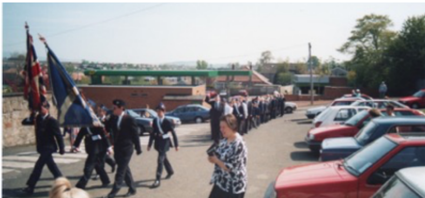
'Old Colours' Paraded In