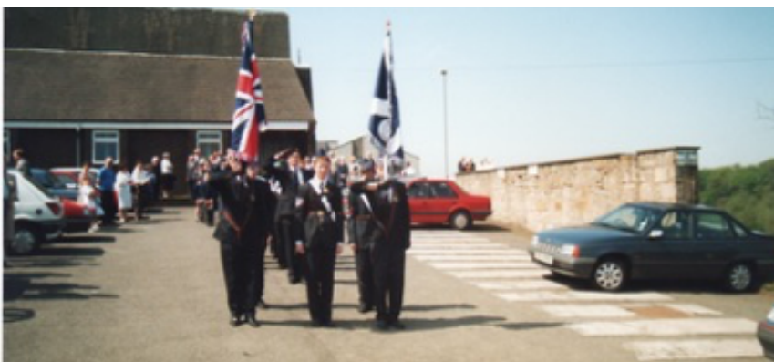
'New Colours' Paraded Out