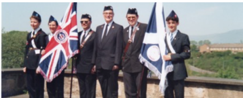
Everything 'Young Bright and Shiny' (Well they were then!!)